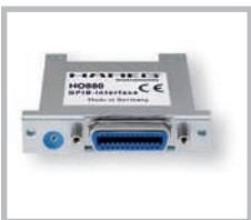
H088-2 IEEE-488 Interface

Electronic load up to 30 W per channel (max. 1 A)