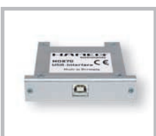
H089-2 RS-232 Interface

Multimeter mode for all adjustable outputs